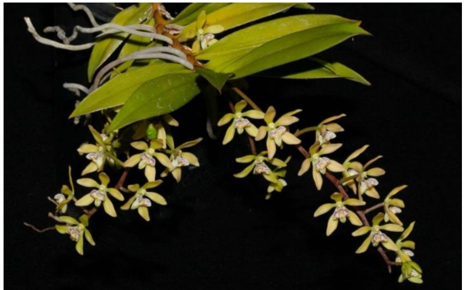
Champion Miniature Orchid Plectochilus Kilgra Lynne & Brian Phelan