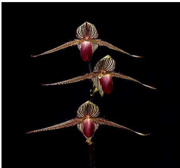
AM Paphiopedilum rothschildianum 'Judgey' Grown by David Judge