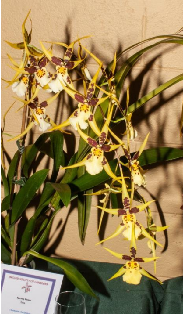
Champion Oncidiinae Brassidium Yellow Star 'Golden Gambol' David Judge