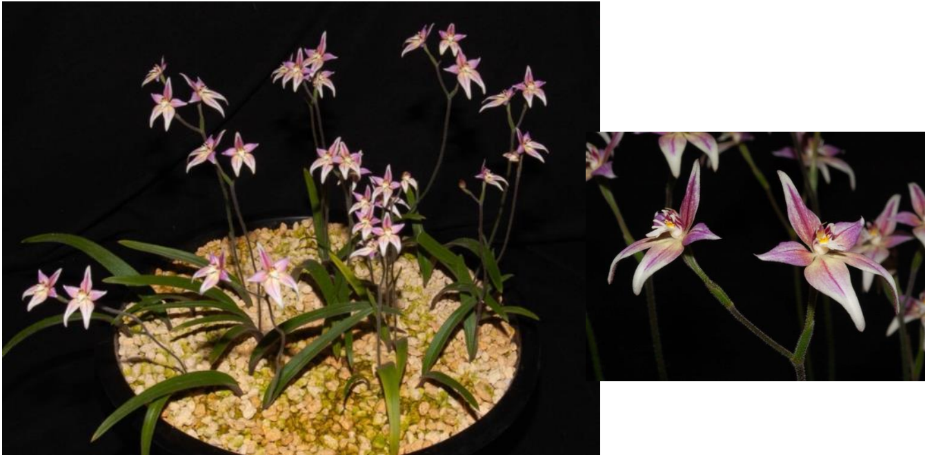
Champion Australian Native Orchid Caladenia Harlequin 'Mandragora' ACM/AOC