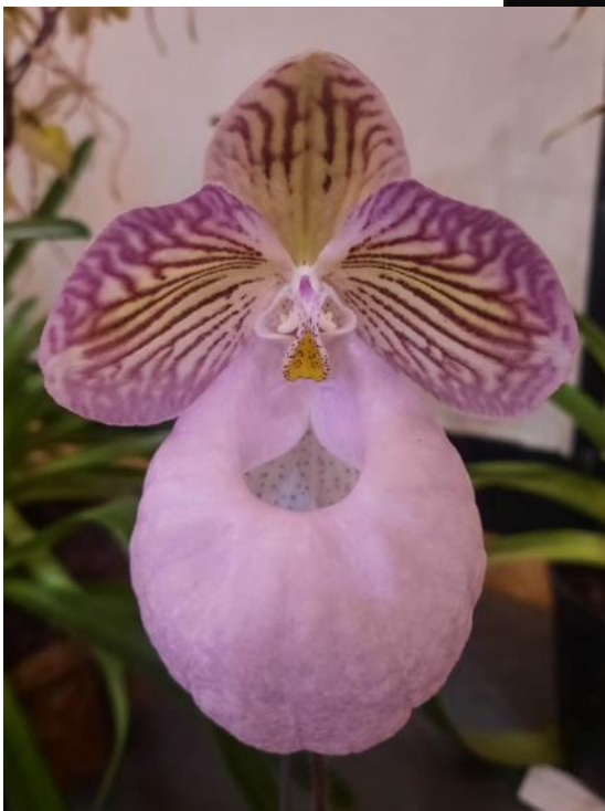
Popular vote Paphiopedilum micranthum 'Bubblegum Fantasy' Mike Pieloor