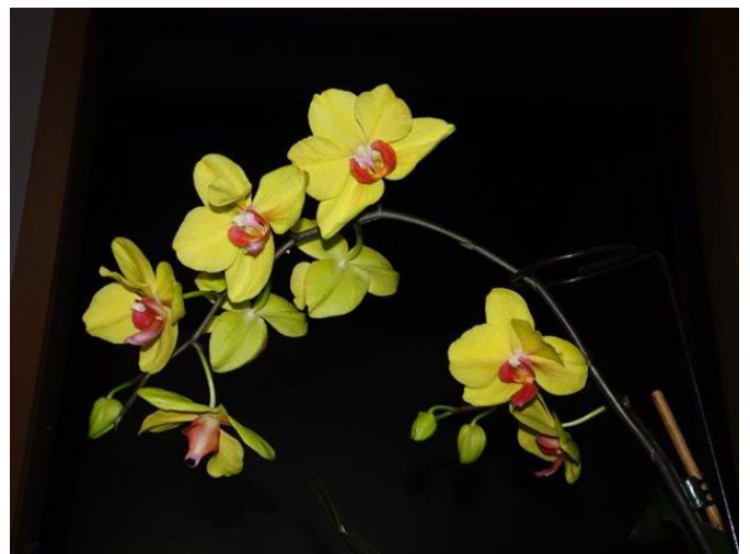
December Novice Orchid of the night Phalaenopsis Unknown , grown by Nick Westerink