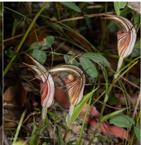
Diplodidium coccinum group