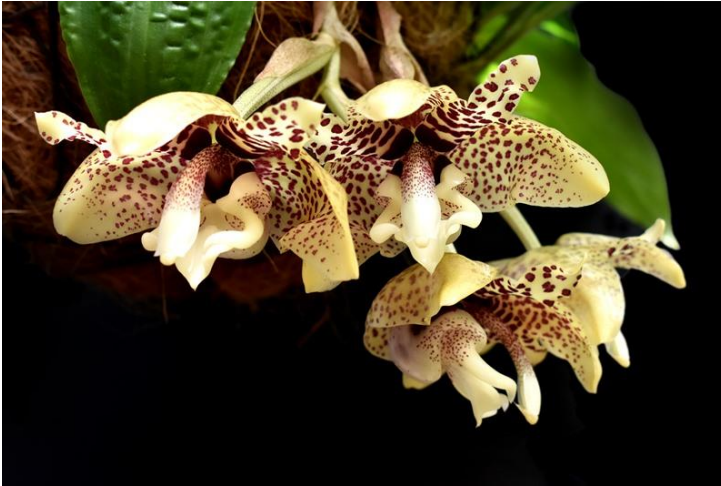
February Popular Vote – novice orchid of the night: Stanhopea hernandezii