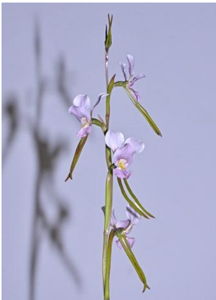
November Judges' Choice Hybrid: Diuris punctata , grown by Paul Tyerman

Cattleyas are not very prone to fungal diseases, but overwatering should be avoided. Viruses are likely to be present in every collection and infections can be detected when cell breakdown is visible as mottling in the flowers' petals and sepals. Infected plants must be destroyed to keep the virus from spreading to healthy plants.