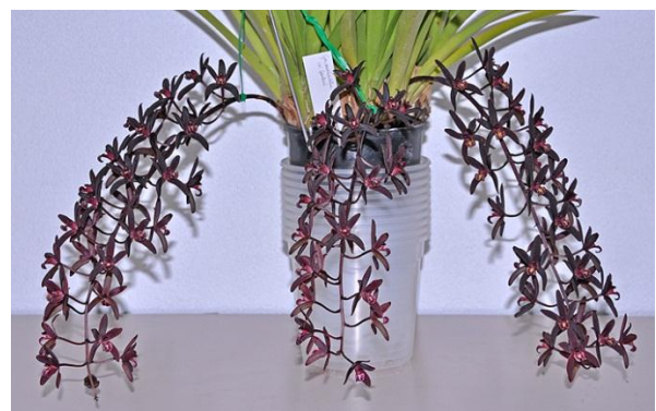
December Orchid of the Night: Cymbidium canaliculatum var. sparksii , grown by Lynne & Brian Phelan