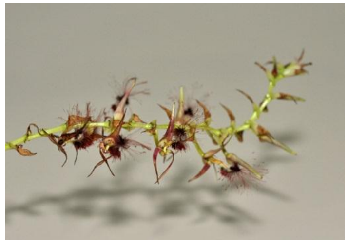
June Orchid of the Night: Bulbophyllum barbigerum , grown by Terry Turner