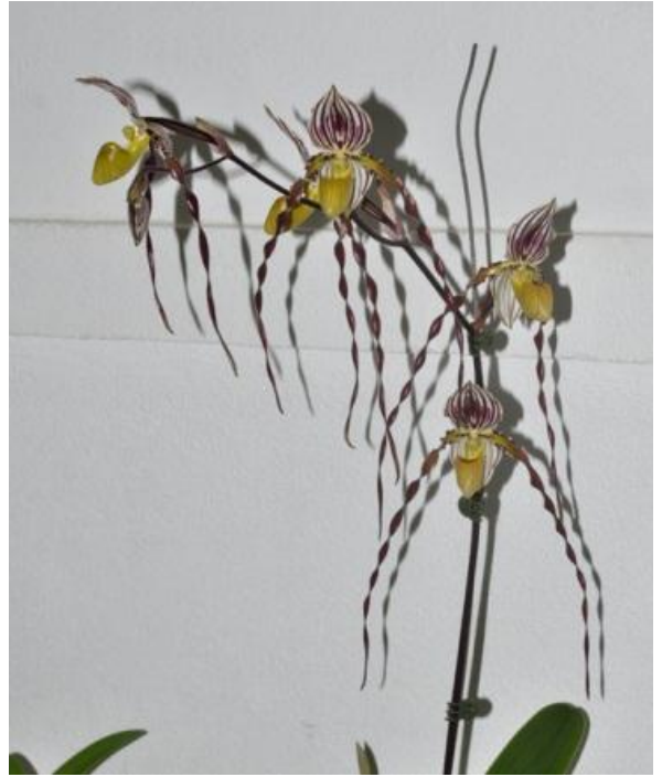
December Orchid of the Night: Paphiopedilum robelinii , grown by David Judge.