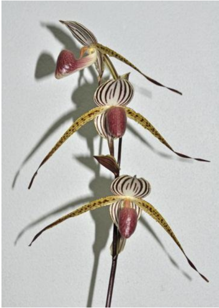
October Judge's Choice Hybrid: Paphiopedilum Lady Isabel, grown by Terry Turner.