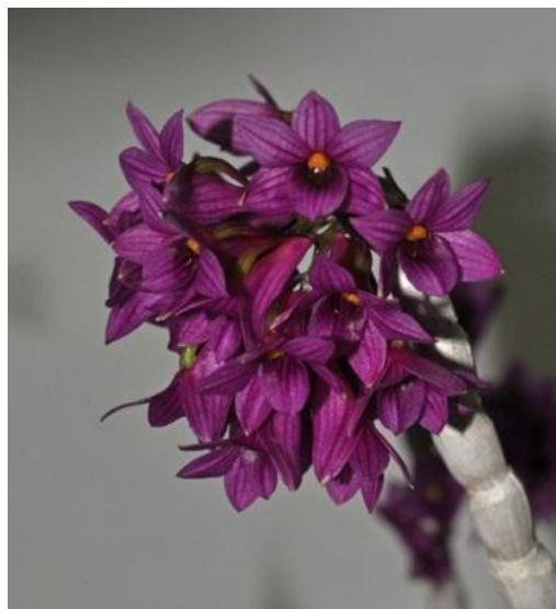
September Orchid of the Night: Dendrobium miyakei , grown by Mark Clements.

Ben showed pictures of the famous food market of Luang Prabang which is the old capital. This part of the country is rich in various temples and shrines.