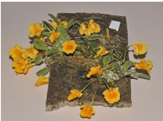
October Orchid of the Night: Dendrobium jenkinsii , grown by Mark Clements.

Wayne talked on a trip he took with his son to the Atherton Tablelands in Queensland some months ago. He showed lots of pictures of orchids in trees and on rocks as well as a few terrestrials. He made the observation that many species of orchids grew on trees overhanging streams and also grew on rocks on the edges of the streams. Interestingly, he found few orchids growing in the middle of the dense rain forest but they were prevalent on the edges near roads and breaks in the vegetation. Often many orchids were seen on trees growing out in the middle of cleared fields some distance from the rain forest. It was an interesting report on the variety of orchids in the area and in the different habitats.