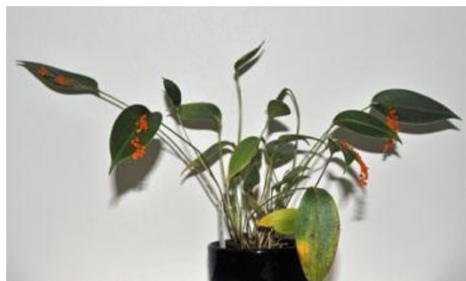
September Judge's choice Species: Pleurothallis truncata , grown by Jane Wright.

All show results can be found at www.canberraorchids.org