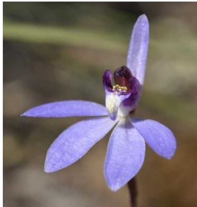
Cyanicula caerulea , photo: Zoe Groeneveld.

The December meeting is the Christmas Party, so please bring a plate of something to share, and yourselves to enjoy the evening. We'll provide a few of the basics – soft drink, tea and coffee etc.