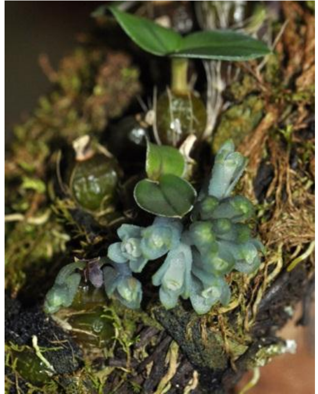
October Judge's Choice Species: Coelandria leucocyania , grown by Ben Wallace.