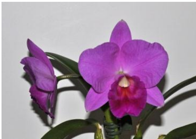
September Judge's Choice Hybrid: Slc. Dendi's Perfection , grown by Rob Rough.