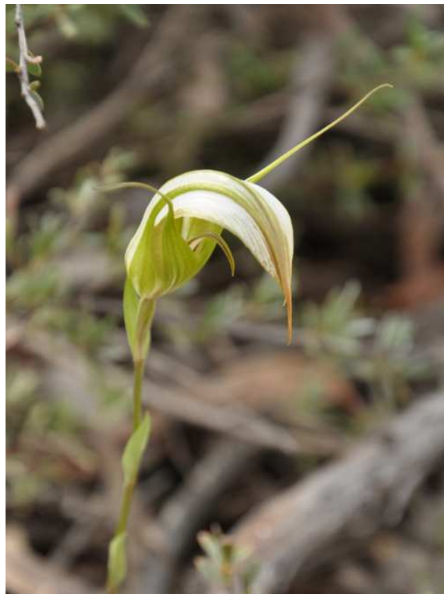
Diploidium reflexum at Black Mt