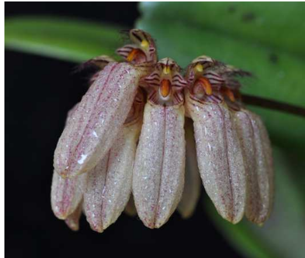
Bulbophyllum sikkimensis