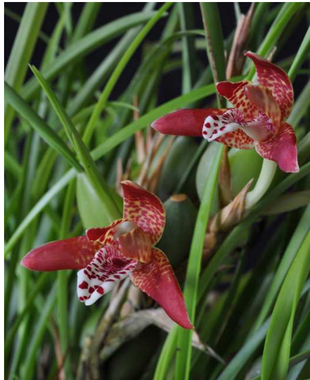
Maxillaria tenuifolia , photo by Zoe Groeneveld