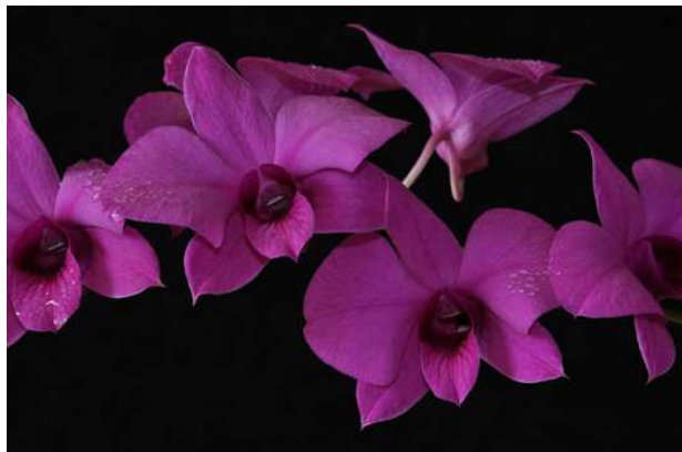
Vappodes phalaenopsis