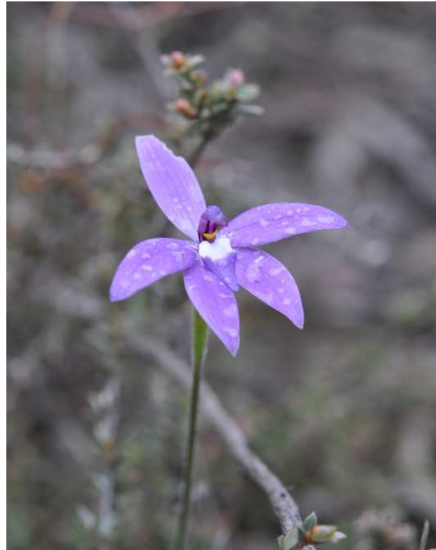
Glossodia major

The email address of the Secretary of the Hort Society is now jrdonlan@live.com .