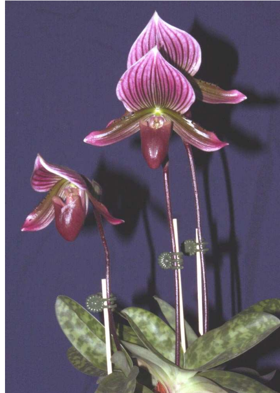
Champion Paphiopedilum Alliance. Paphiopedilum Treasure Island 'Perfect Pink' X Paph. maudiae 'Flaming Ruby' grown by Don Chesher