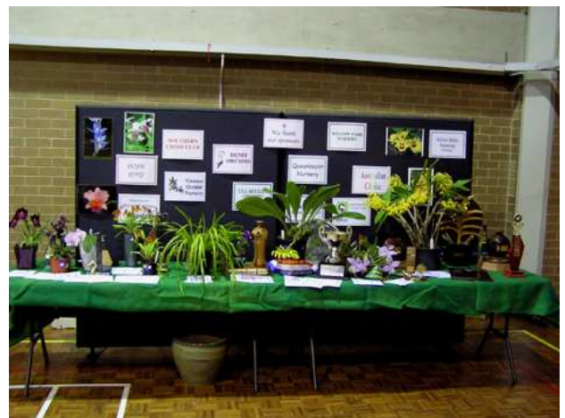
The Champions Table at the Show