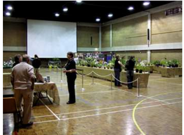
The venue at CIT, getting ready to open