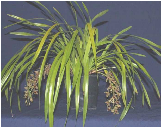
Champion Cymbidium. Cymbidium Scallywag 'Sweet Charms' grown by Brian and Lynne Phelan