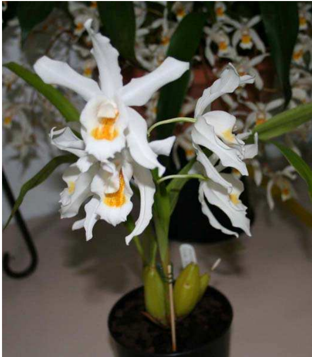
Judge's Choice for hybrid in September Coel. moreana X cristate grown by Don Chesher