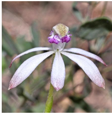
Deformed individual of Stegostyla ustulata