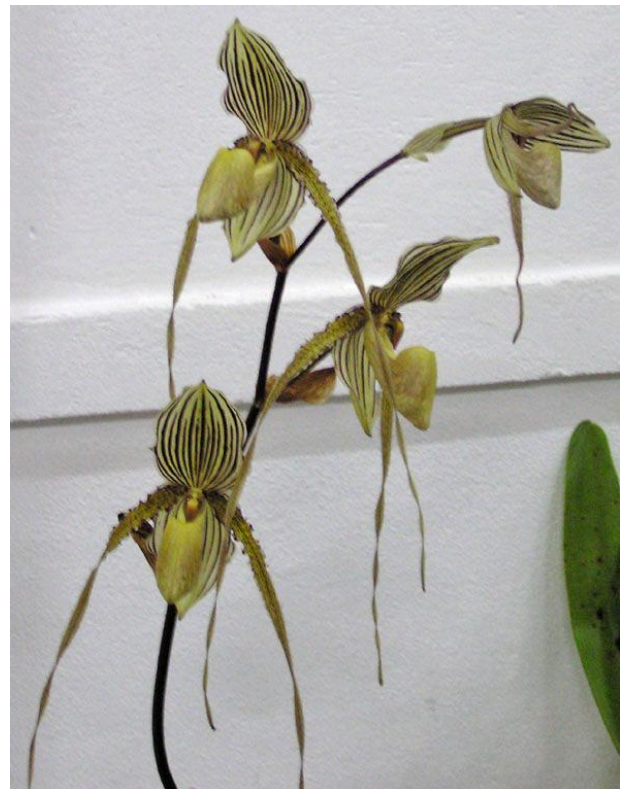
August Judges' Choice hybrid: Paphiopedilum Saint Swithins, grown by Terry Turner

Sancell is an Australian plastics company operating in Victoria. Sancell manufactures a UV-resistant, clear bubble-wrap designed to provide a long-lasting, insulative cover for greenhouses. The triple laminate, UV400 bubble-wrap is flexible, yet very strong and resistant to hail. It can be easily formed around igloos or hung inside glasshouses to provide insulation (UV400 has a thermal conductance of 3.9, compared with 8.1 for 3mm glass). Tests conducted by Sancell indicate a light transmission of 80%. For further information see www.sancell.com.au (and click on the link to covers/blankets).