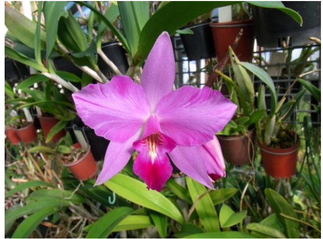
Laelia anceps 'Neon Splash'

At the other end of the scale is Sophranitis cernua . This is a diminutive plant, but with very pretty and richly coloured flowers. The photo below is one of a number of plants growing and flowering in a community pot.