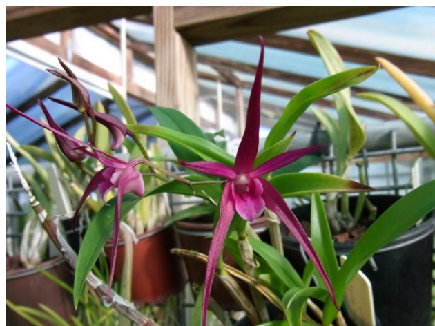
Dendrobium Kathleen Eugene 'Midnight'