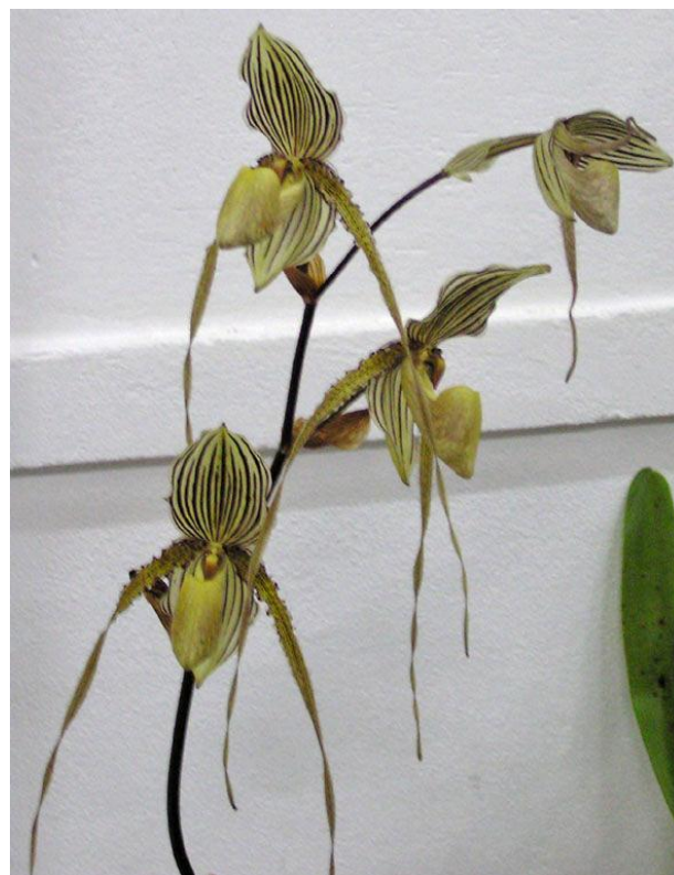
August Judges' Choice hybrid: Paphiopedilum Saint Swithins, grown by Terry Turner

Sancell is an Australian plastics company operating in Victoria. Sancell manufactures a UV-resistant, clear bubble-wrap designed to provide a long-lasting, insulative cover for greenhouses. The triple laminate, UV400 bubble-wrap is flexible, yet very strong and resistant to hail. It can be easily formed around igloos or hung inside glasshouses to provide insulation (UV400 has a thermal conductance of 3.9, compared with 8.1 for 3mm glass). Tests conducted by Sancell indicate a light transmission of 80%. For further information see www.sancell.com.au (and click on the link to covers/blankets).