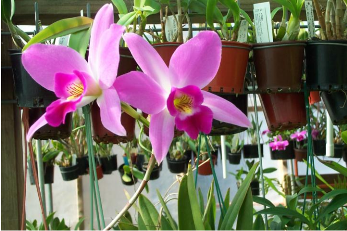
Laelia anceps 'Irwins' AM/AOC

There are a couple of splashes of colour, however. My plants of Laelia anceps are blooming, and they are good value as they are easy to grow and flower regularly each year. The pick of the plants I have is Laelia anceps 'Irwins' AM/AOC, closely followed by the clone known as 'Neon Splash'.