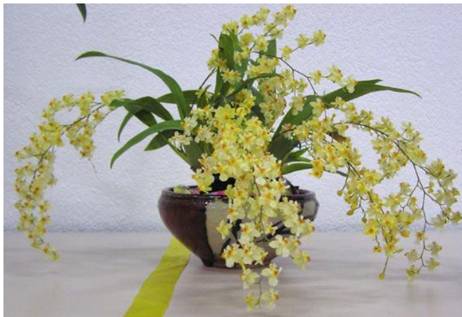
August Orchid of the Night: Oncidium Twinkle 'Fragrance Fantasy', grown by Quin Yuen Chung