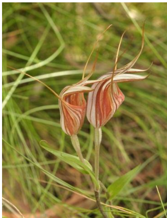
Currently flowering around the ACT - Diplodinium coccinum , photo by Zoe Groeneveld.