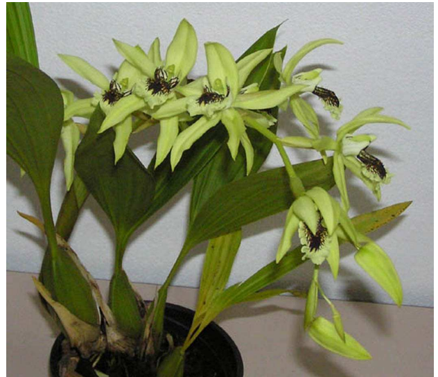
December 2008 Judge's Choice species (tied) Coel. pandurate grown by Don Chesher