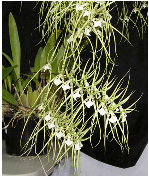
December 2008 Judge's Choice species (tied) and Orchid of the Night Brassia verrucosa grown by David Judge