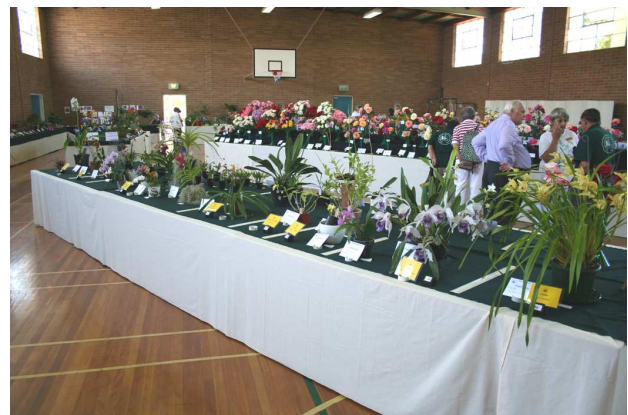
Orchid table at the November 2008 Horticultural Show

Champion Specimen Orchid: $10 plus a ribbon