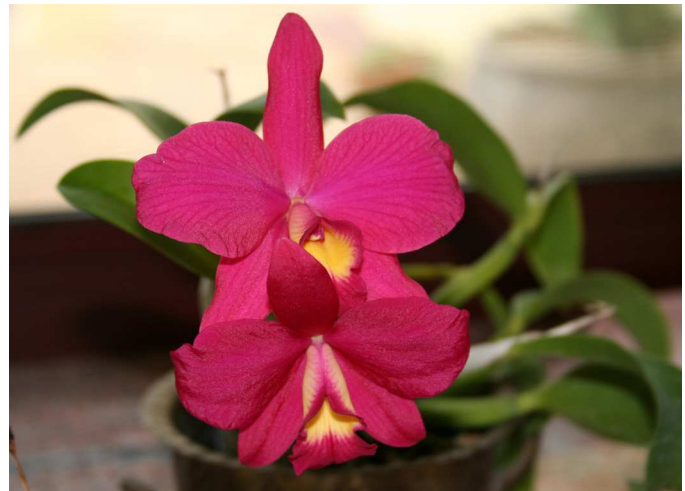
Photographs of displays by Jane Wright